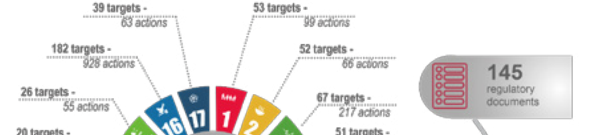
Fig. 1. Status of SDG incorporation into the current regulatory acts (national strategic and policy documents)

lack of long-term vision of development and reform implementation plans linked with SDGs (outlining top-priority reforms